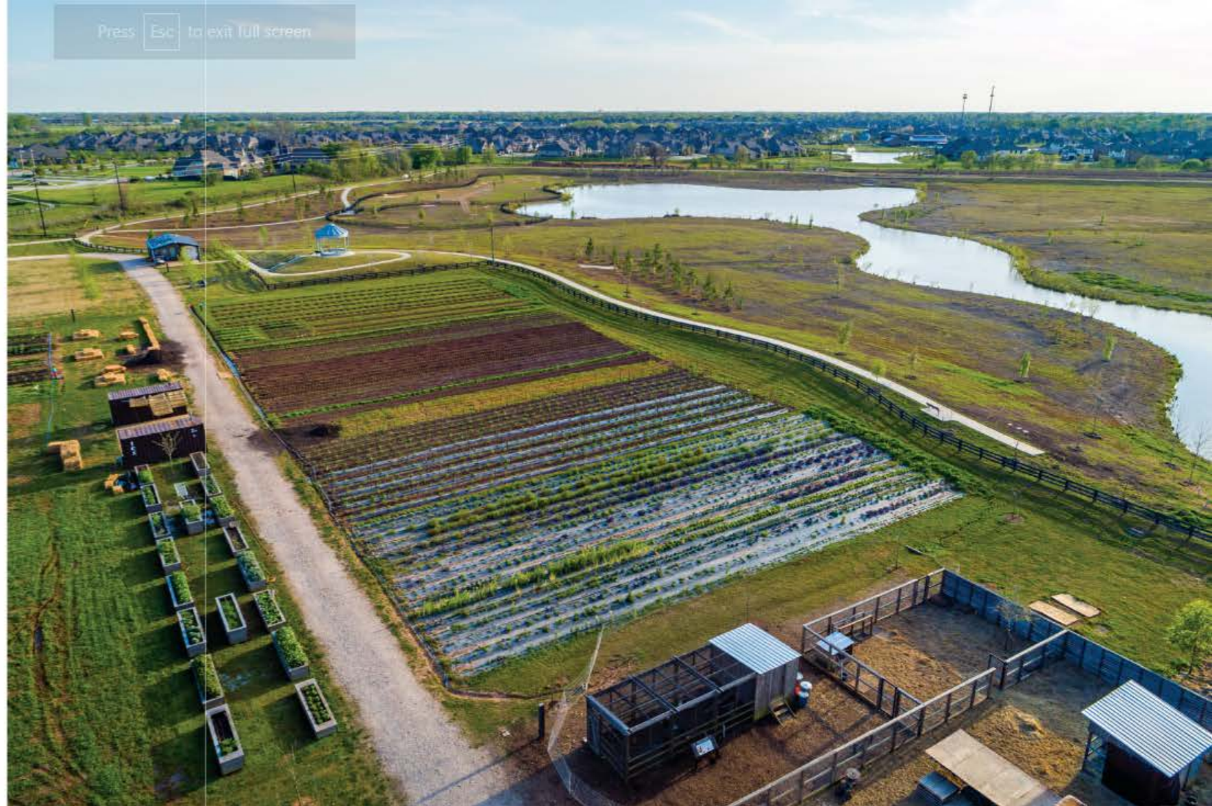
ABOVE Village Farm at Harvest Green contains raised and flat garden beds, plots reserved for resident members, a grain bin-themed gazebo, a fruit orchard, and shelters for hens and goats.

None of this work is easy, especially when agrihood developments occur on existing farms, which are often equipment intensive and difficult to maintain, manage, and financially sustain. To improve outcomes, consultancies such as Agmenity, Farmer D, and Farmscape are stepping in to advise development teams, hire and train farmers, and manage farm operations.