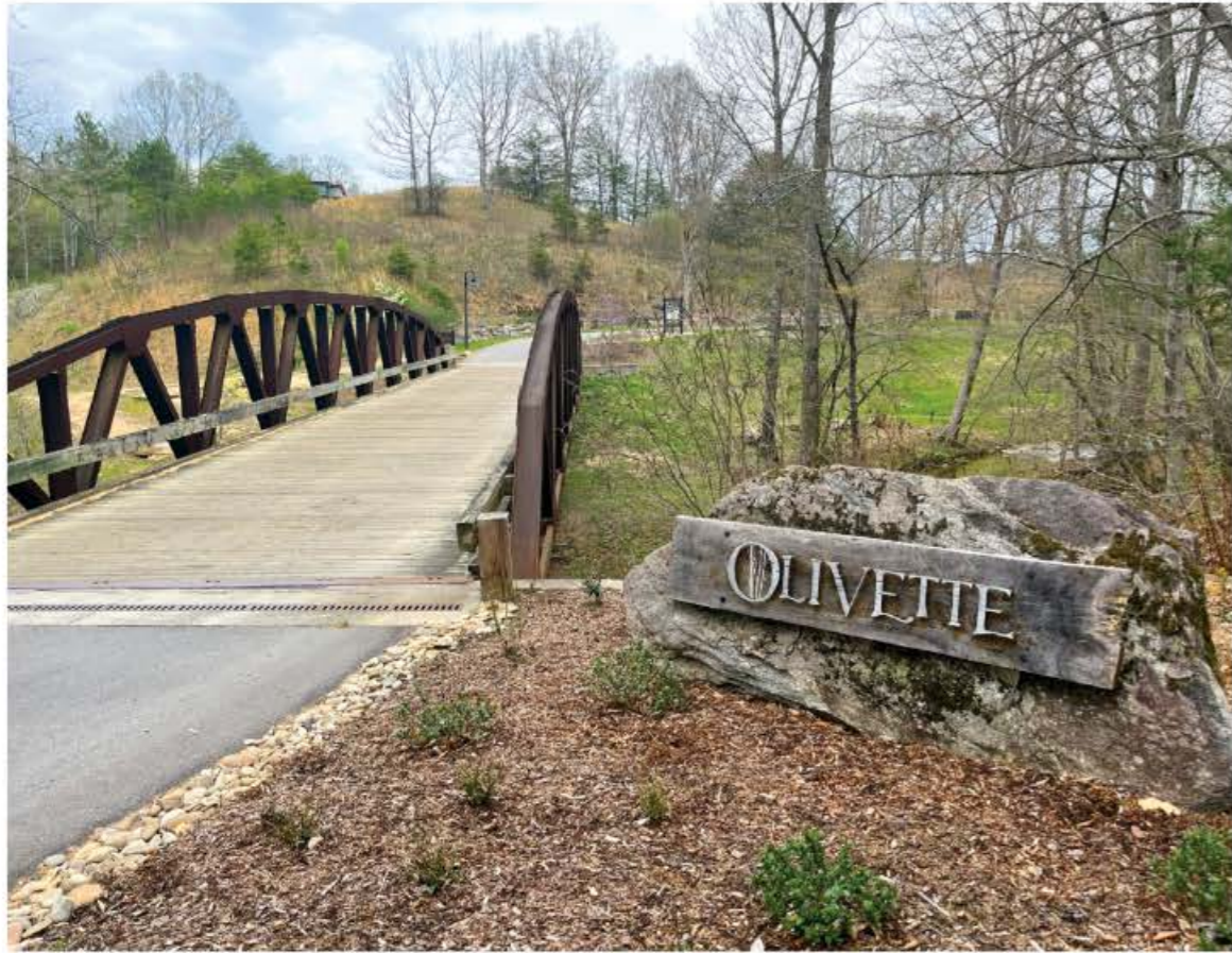
LEFT The entrances to Olivette are designed to be open and inviting to public visitors, who can use the trails and other amenities.

Harvest Green, a 1,300-acre agrihood in Richmond, Texas, designed by SWA Group, is one example of how the Wendell Berry-meets-New Urbanism land ethics are worked out. Lying 30 miles outside Houston and almost continuously farmed since the 1820s, the community is planned for 3,200 homes and additional apartments; 300 acres of lakes, parkland, and green space; 17 miles of trails; a working farm; a greenhouse; a farmers' market; and vineyards.